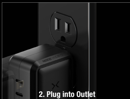
2. Plug into Outlet