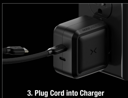
3. Plug Cord into Charger