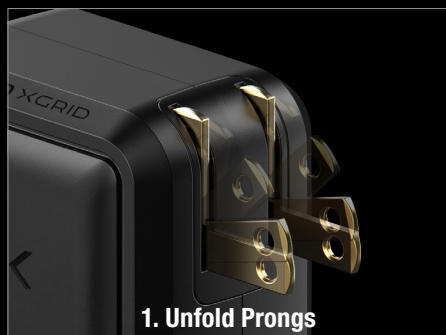
1. Unfold Prongs