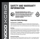
Safety and Warranty Information