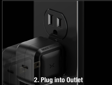
2. Plug into Outlet