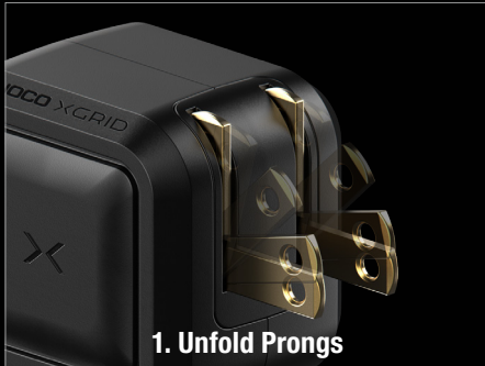
1. Unfold Prongs