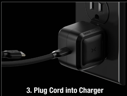
3. Plug Cord into Charger