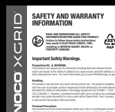
Safety and Warranty Information