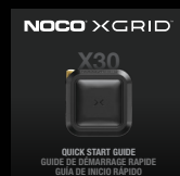
Quick Start Guide