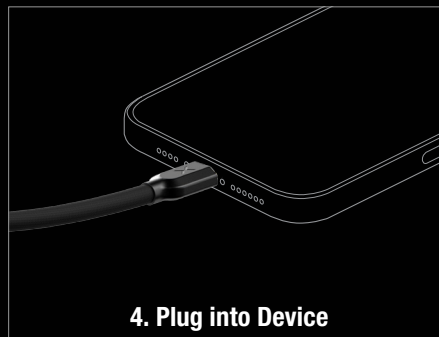
4. Plug into Device