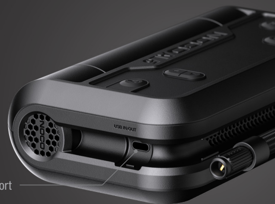
30W USB-C Port

Introducing our all-new battery-powered air compressor for balls, bikes, vehicles, and more, but without the cords.