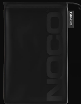
Microfiber Storage Bag

AIR20 Portable Air Compressor w/ 3ft Braided Hose & 20ft Power Cord + Clamps